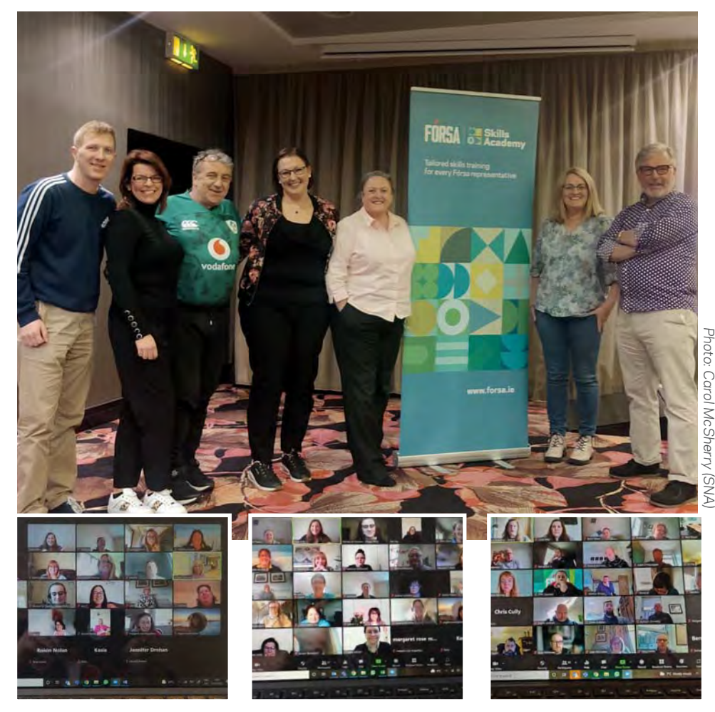
Despite the challenges of providing simultaneous remote and in-person training options, and the continuing disruption and uncertainty caused by Covid-19, more than 100 Fórsa workplace reps are currently attending our workplace representative training.

Ahead of conference this year we put a lot of work into developing training for principal delegates to conference, including a session for new delegates which was also open to returning delegates to attend if they wanted some refresher training. After all, it had been a