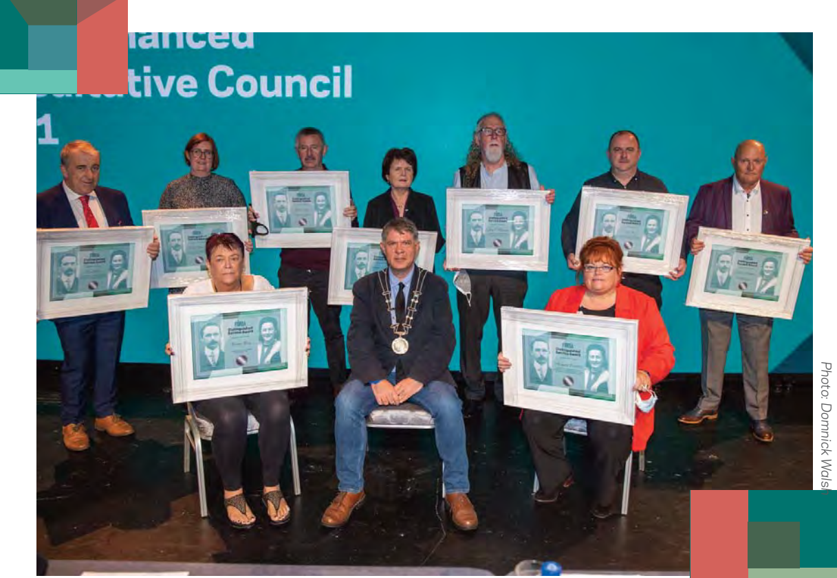
Distinguished service award recipients 2021.

On the basis that the department document made clear that local authority workers would not be required to transfer to the new entity, and could remain in the employment of their local authority, the union side agreed to resume discussions on strand four, the industrial relations element of the negotiations. At the time of writing this report, a number of meetings have been arranged with the WRC with no real progress to date.