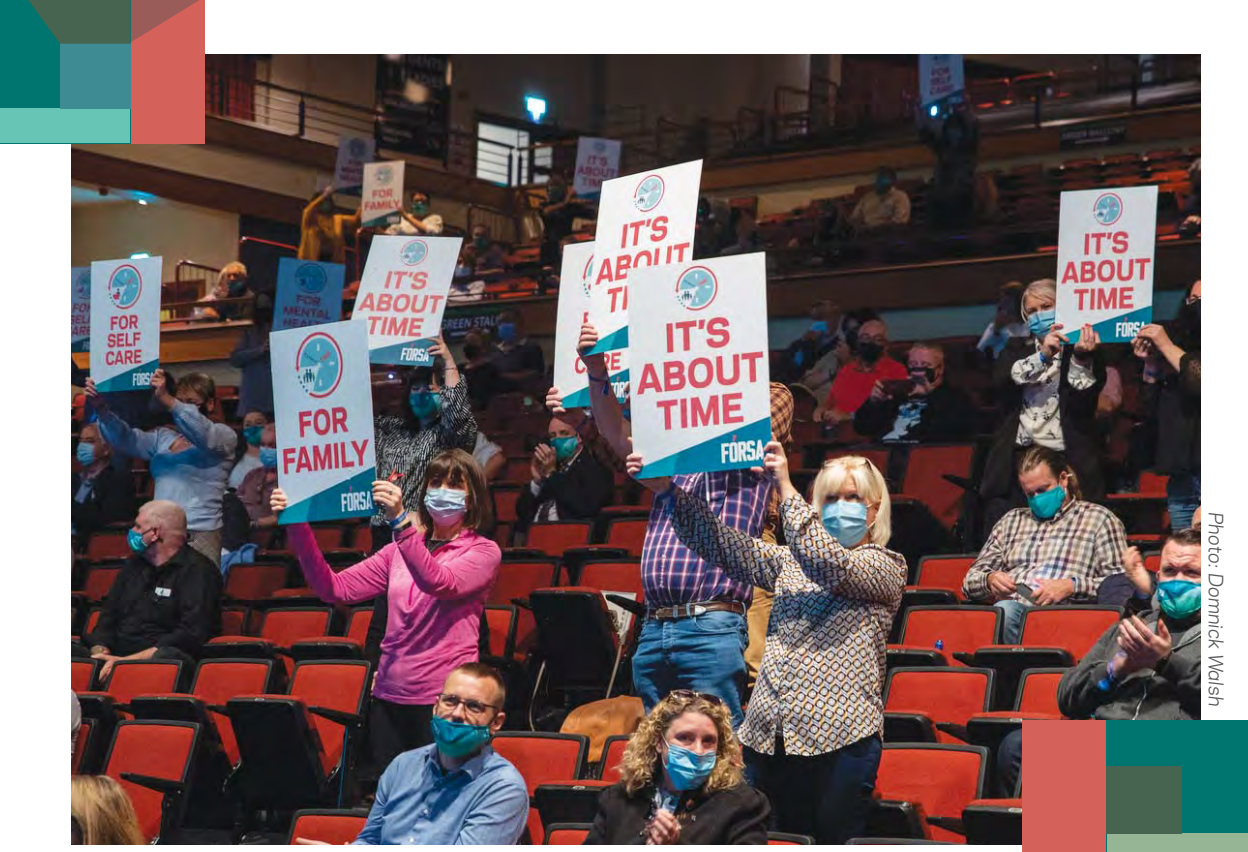
Issue-based strategies have included pay, hours and leave which led to the creation of the interactive It's about time strategy, which directly influenced the organisation's policy at national level.