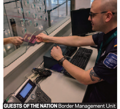
Department Departmental Council:

The union has also made representations on behalf of Mediators, who have not been afforded the same remote working options as other staff.