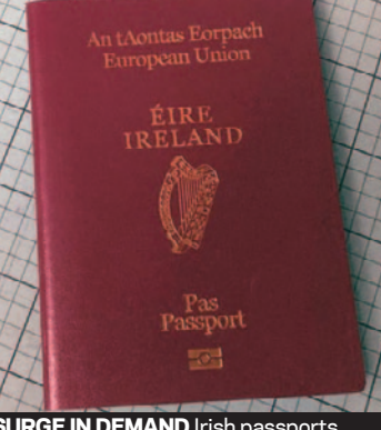
SURGE IN DEMAND Irish passports

breaks in offices in Cork and Balbriggan," he added.