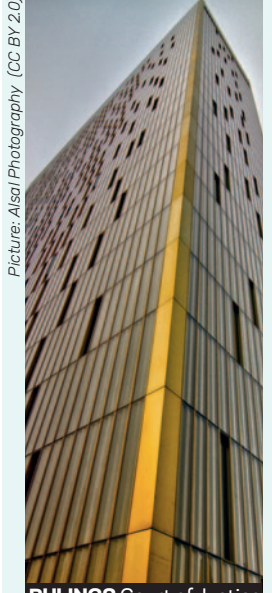
Illustration: Xoan Baltar (CC BY 2.0)

These national surveys follow Fórsa's own survey carried out last year in which more than 80% of members reported experienceing problems with the centralised pay and leave system